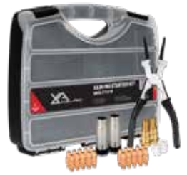
XA36 BZL Torch Consumable Parts Kit

$100.00 Including GST $86.96 excluding GST XAMSK36