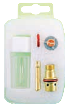
Pyrex Gas Lens Kit Medium Nozzle