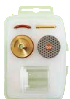
Fat Boy Pyrex Gas Lens Kit Great for titanium!

SUITED TO CONVENTIONAL TIG TORCH DESIGNS