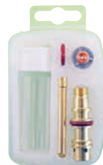
Pyrex Gas Lens Kit Long Nozzle