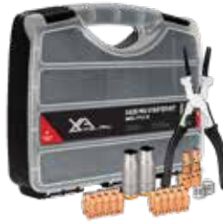
XA25 BZL Torch Consumable Parts Kit

$79.00 Including GST $68.70 excluding GST XAMSK25