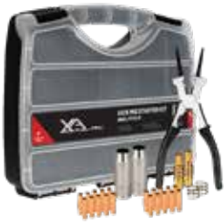
XA15 BZL Torch Consumable Parts Kit

$69.00 Including GST $60.00 excluding GST XAMSK15