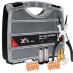
XA24 BZL Torch Consumable Parts Kit

$79.00 Including GST $68.70 excluding GST XAMSK24